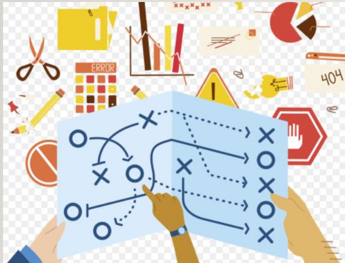
Playbook (how-to guide)