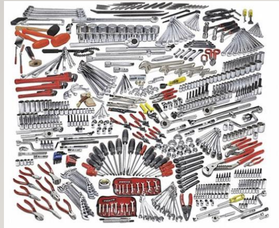
Tool Kits (compass, maps, etc.)